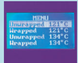
B. LCD Display